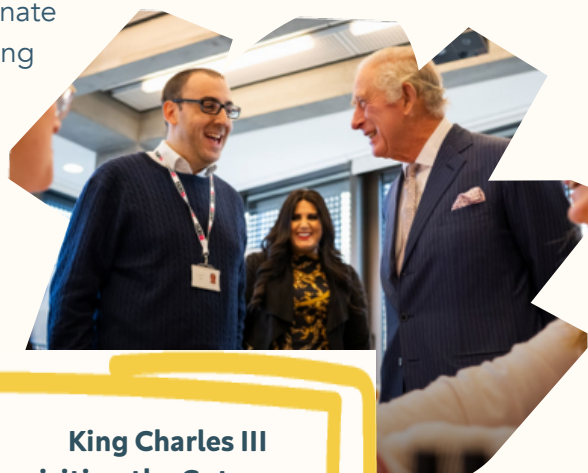
King Charles III visiting the Gateways programme & meeting its founder.

We have also learned so much and we go into our new chapter with an extremely strong platform for growth, based on our demonstrated performance and the strength of our partnerships.